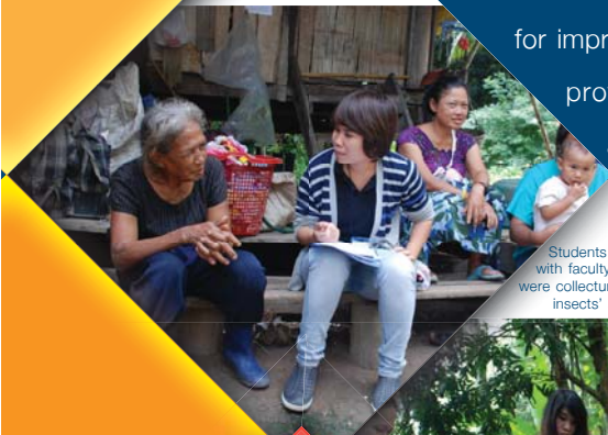
Students coupled with faculty members were collecting water and insects' samples.