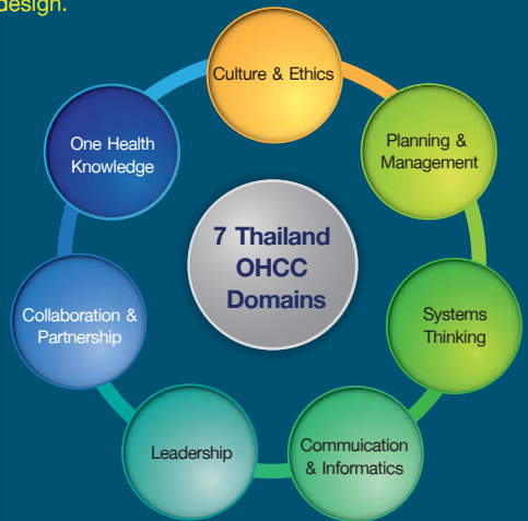
Thailand One Health Core Competency domains

According to the workshop's evaluation, more than 70 percent of participants stated that the OHCC was "new" to them, while approximately 12 percent said that they never heard about this concept before. Many found that the workshop was useful and would like to integrate the OHCCs into their existing courses, while some also shared their experiences in adapting the idea to their programs.